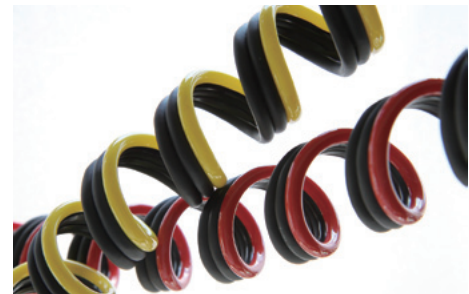
(VEYOR-CABLE processing example)